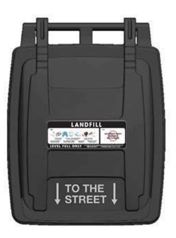
2021 Exclusive Franchise Agreement