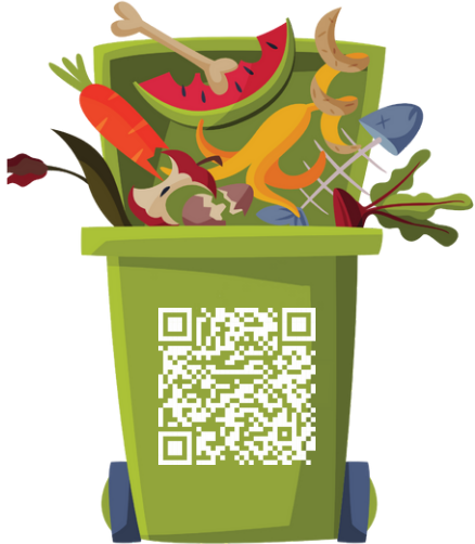
Scan QR code for residential recycling and hauler contact information.

Organic waste now includes food such as meat, fish, dairy, fruits, vegetables, bread and other food scraps, in addition to green waste, grass clippings and leaves. These items are now recycled, rather than buried as waste.