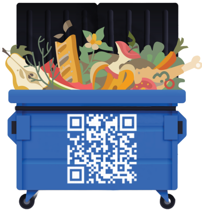
Scan QR code for commercial recycling and hauler contact information.

For residential recycling and hauler contact information please visit OCLandfills.com/residents