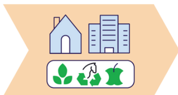
Residential & Commercial organic waste